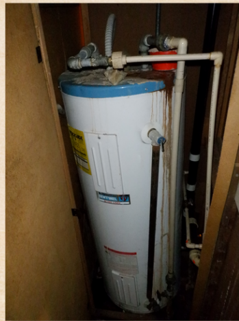
LEFT: Old water heater. RIGHT: New water heater installed

"Our family could never have afforded the new septic system on our own. Really not sure how we would have managed much longer, even with limiting showers and doing laundry at my parent's house. We are so grateful. Keep doing what you're doing to assist people."