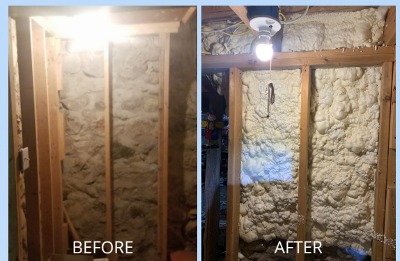
RIGHT: basement walls in old farmhouse before (uninsulated) and after (insulated).