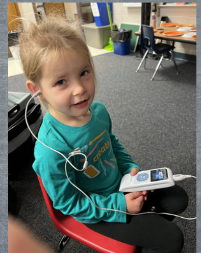
BOTTOM: Classroom Health Days

I believe the impact that the teachers alone had on myself and my daughter will be lifelong. My daughter absolutely loved being able to have the interaction with other children, being able to learn new things, make art projects and things like planting a sunflower. She really enjoyed her introduction to school through this preschool.