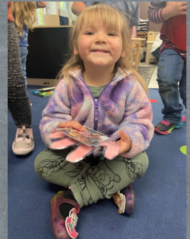
TOP: Holding a photo of her family connected to a laminated cut-out of her Mom's hand to she can hold it when she is missing her!