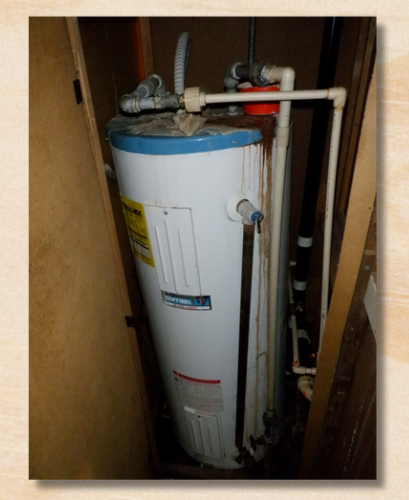
LEFT: Old water heater. RIGHT: New water heater installed

"Our family could never have afforded the new septic system on our own. Really not sure how we would have managed much longer, even with limiting showers and doing laundry at my parent's house. We are so grateful. Keep doing what you're doing to assist people."